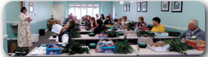
Preparing to make gorgeous centerpieces at our Williamsburg-themed November meeting.