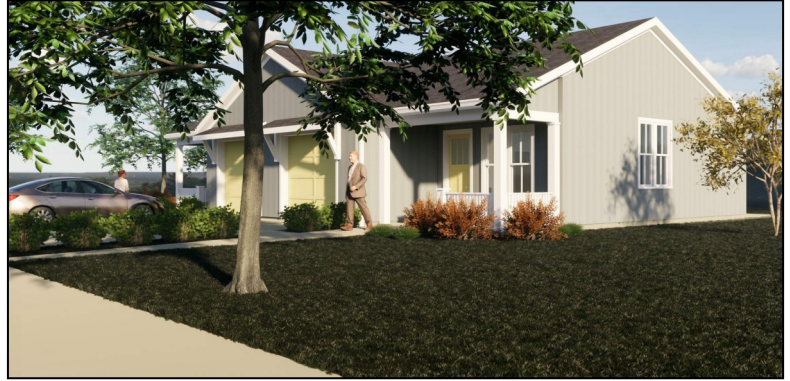
TREK Development Concept Drawing

TREK Development Group is proposing to demolish the existing Shaffer School at 37 Garden Terrace and construct a private road with duplexes for Senior Housing (ages 62+). There would be 20 duplexes (40 units) with a mix of 30 one-bedroom and 10 two-bedroom units. The units would be single-floor living and provide for easy access from the driveway to the front door. There would be four fully accessible units. Each unit would have a single car garage with enough room to park an extra vehicle in the driveway. The private road would have a sidewalk around the perimeter, which would connect to Garden Terrace. In addition to the sidewalk, there will be another 1,200 feet of walkways on the site. The development will have a community center for exercise, gatherings, senior support services, etc.