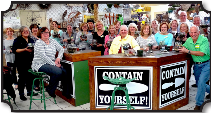
Photo: CGC members show off their creations at last April's Terrarium Workshop.